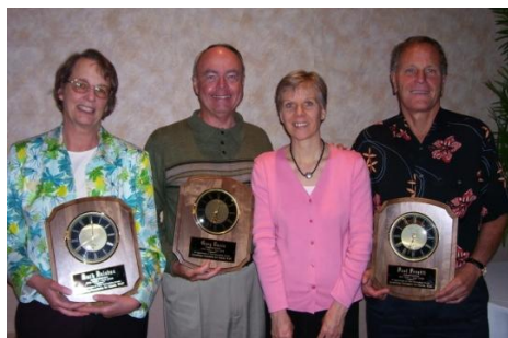
2008 ACS WASC Commission Awards