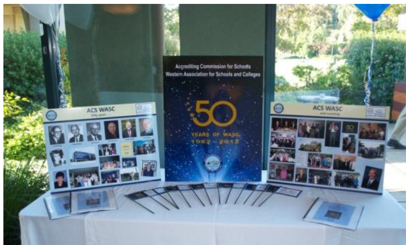
2012 ACS WASC 50-Year Celebration