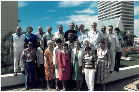
1986 ACS WASC Commission