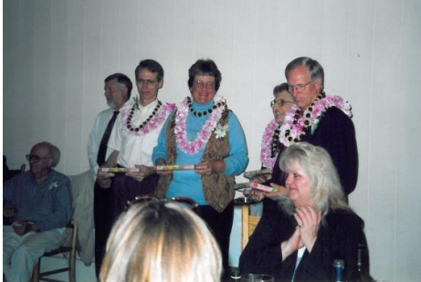
1991 ACS WASC Commission