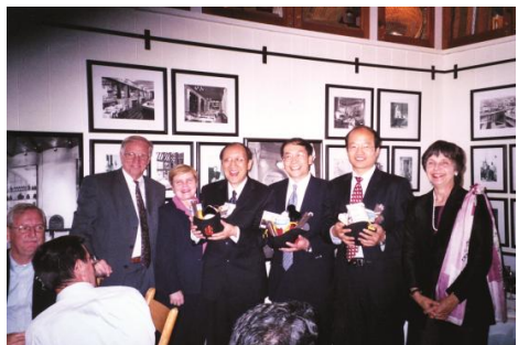
2005 ACS WASC Commissioner Awards