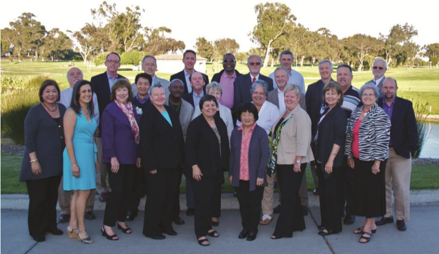
2012 ACS WASC Commission