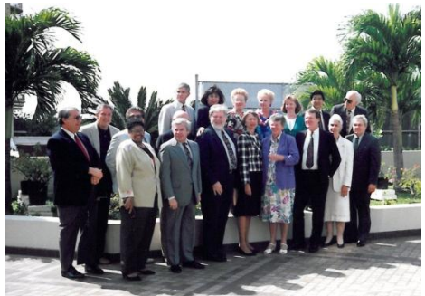
1992 ACS WASC Commission