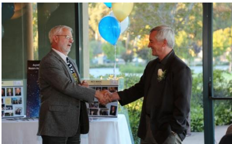
2012 ACS WASC Commission Awards