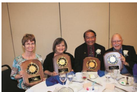
2011 ACS WASC Commission Awards