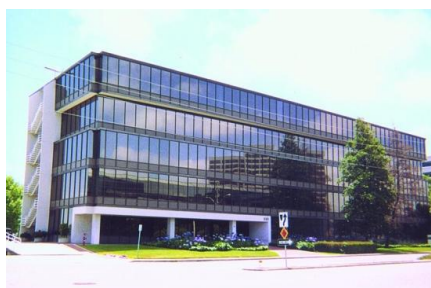
ACS WASC Burlingame Office