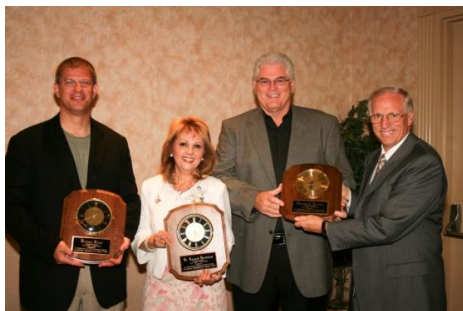
2009 ACS WASC Commission Awards