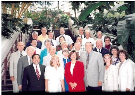
1996 ACS WASC Commission