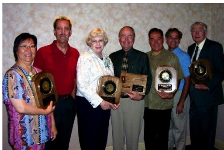
2007 ACS WASC Commission Awards