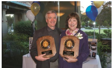
2012 ACS WASC Commission Awards