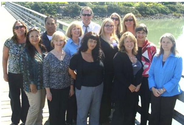
ACS WASC Burlingame Staff, 2012