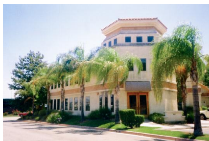
ACS WASC Temecula Office