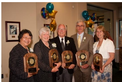
2010 ACS WASC Commission Awards