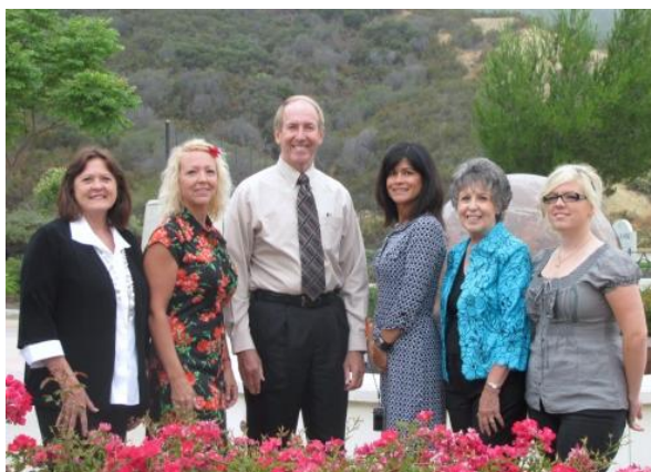
ACS WASC Temecula Staff, 2012