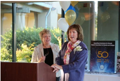
2012 ACS WASC Commission Awards