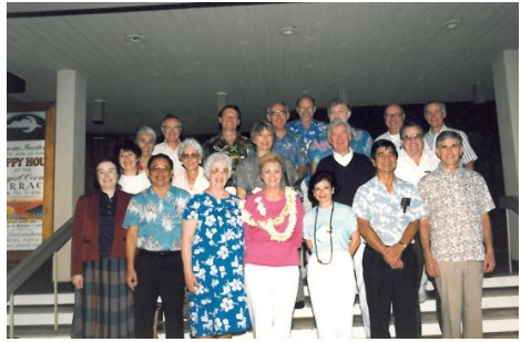
1989 ACS WASC Commission Awards