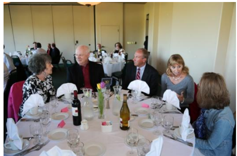
ACS WASC Summer 2012 Commission Meeting